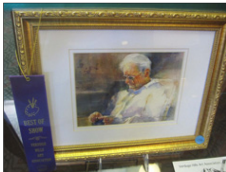
Devorah Friedman's watercolor, "Old Man Seated," won Best of Show in the VHAA Small Image Show.